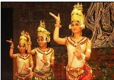
Apsara Dance Show