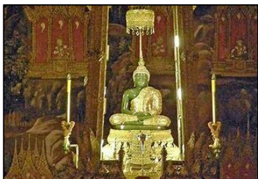
Temple of the Emerald Buddha