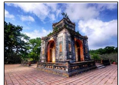
Royal Tomb of Tu Duc