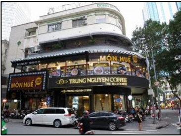
Dong Khoi Street