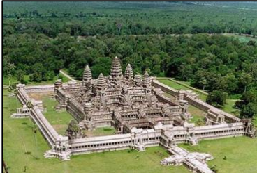
Temples of Angkor