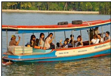
Boat Ride on Canals