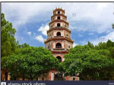
Thien Mu Pagoda