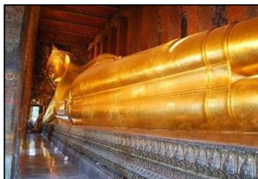
Temple of the Reclining Buddha