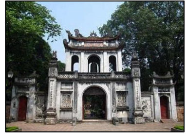
Temple of Literature