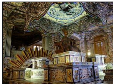
Tombs of Nguyen Emperors