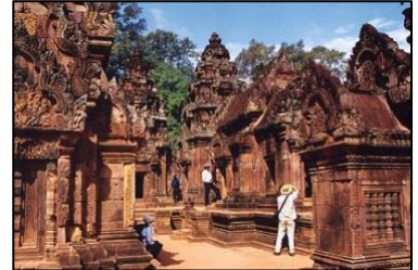
Temple Banteay Srei