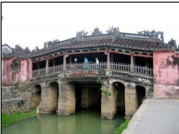
Hoi An Museum Bridge