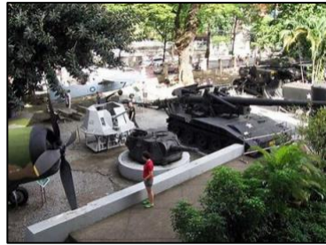
War Remnants Museum