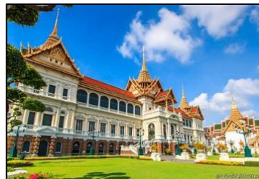
Bangkok Grand Palace