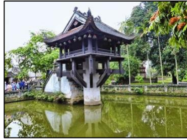
One Pillar Pagoda