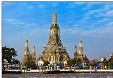
Temple of the Dawn