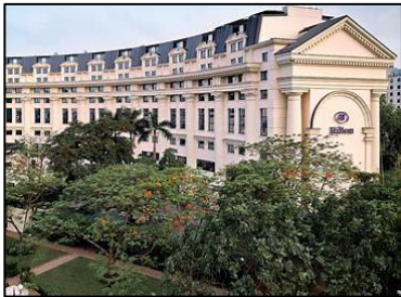
Infamous Hanoi Hilton