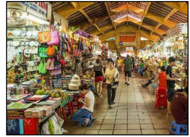
Ben Thanh Market