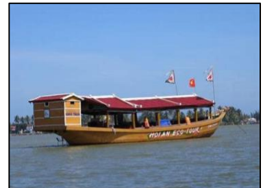
Thu Bon River Cruise