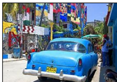
Callejon de Hamel