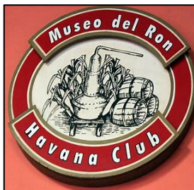
Havana Club's Rum Museum