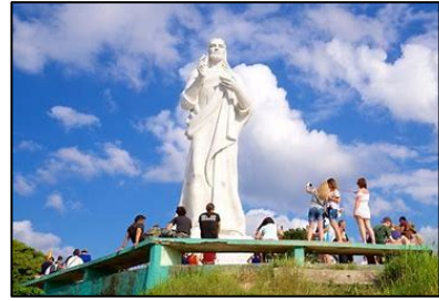
El Cristo de La Habana