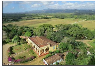
Sugar Mills Valley