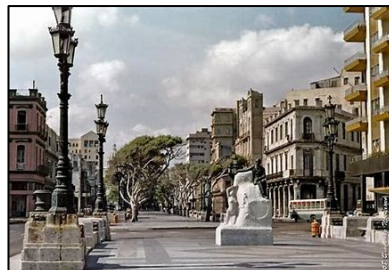
Paseo Del Prado