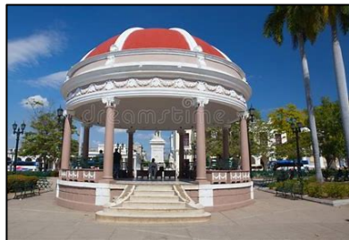
José Martí Square