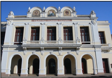
Tomas Terry Theatre