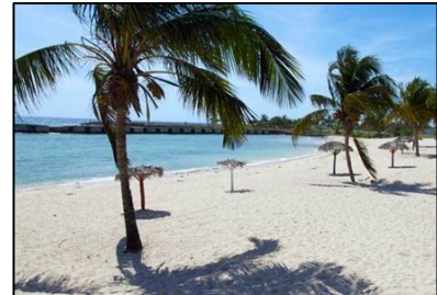
Bay of Pigs Beach