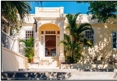
Finca Vigia (Ernest Hemingway's Estate)