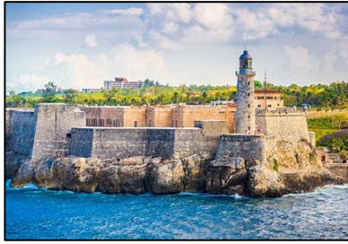
El Morro Fort