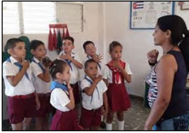
National Deaf Center