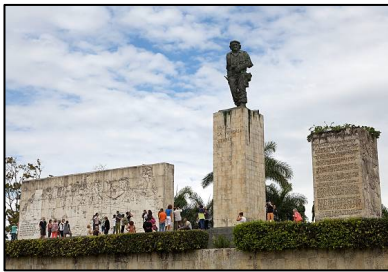
Che Guevara Mausoleum