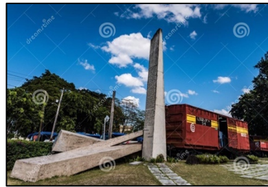
Tren Blindado National Monument