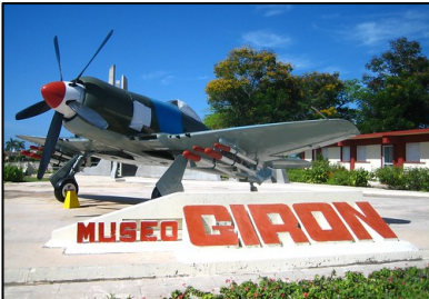
Bay of Pigs Museum