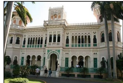
Palacio de Valle