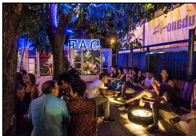
Cuba Art Factory