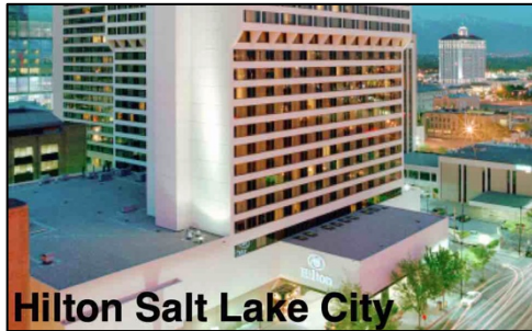
Hilton Salt Lake City