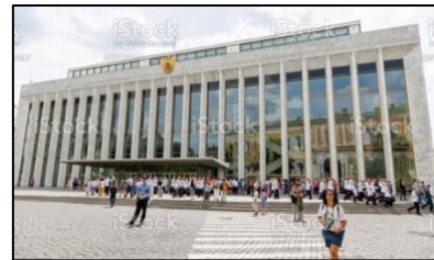
Palace of Congresses