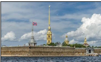
An inside tour of Peter & Paul Fortress