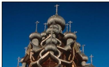
Church of Transfiguration with its 22 cupolas