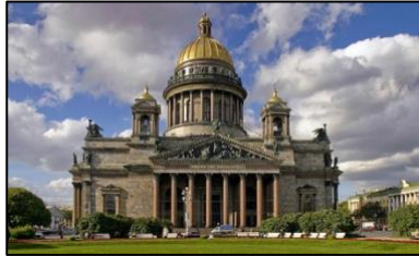
St Isaac's Cathedral