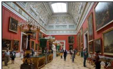
Tour of the world-famous Hermitage Museum