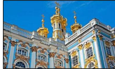
Palace of Tsarevich Dmitry