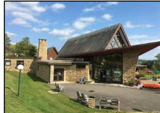
Alexander Graham Bell Museum