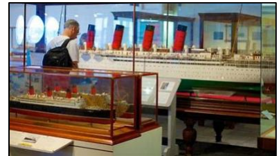
Maritime Museum of the Atlantic