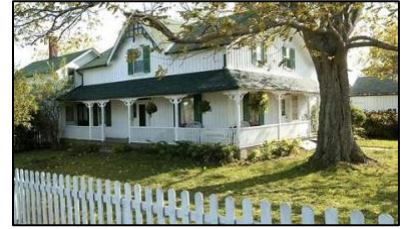
Anne of Green Gables House