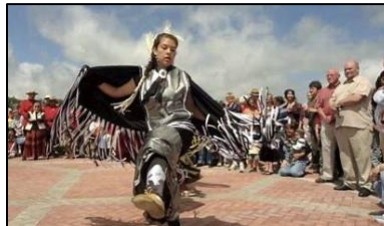
M'Kmaq Heritage Center