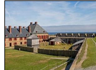
Fortress of Louisbourg