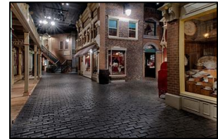
Royal British Columbia Museum