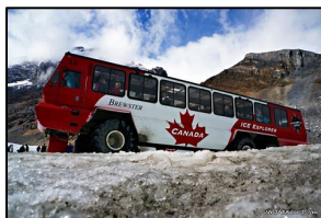
Ice Explorer Ride