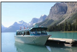
Spirit Island Cruise