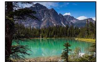
Jasper National Park