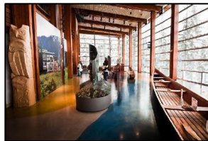
Squamish Lil'wat Cultural Centre