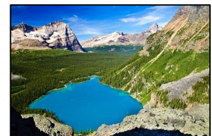
Yoho National Park