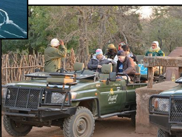
Makalali Private National Park