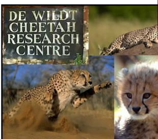
Cheetah Breeding National Park