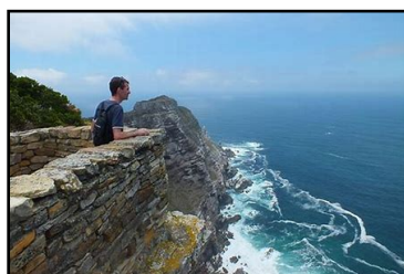
Cape Point Nature Reserve