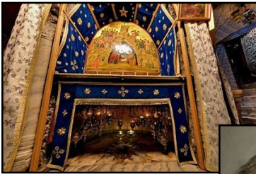
Church of the Nativity