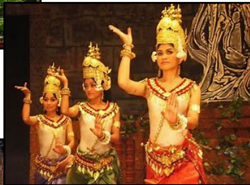
Apsara Dance Show