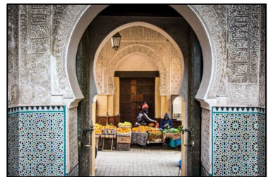
Medersa Bou Inania