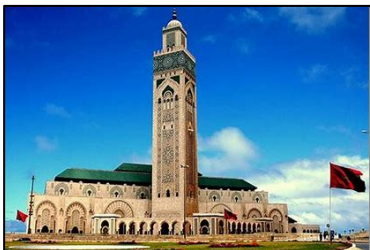
Hassan II Mosque