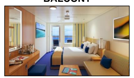
Category BL $789 + 200.86 taxes & fees + $87.00 gratuities (Per Person – 2 in a room)

Call for 3<sup>rd</sup>/4<sup>th</sup> guest discounts