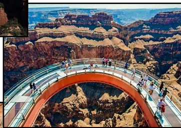
Grand Canyon East Rim View