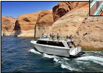
Antelope Canyon Cruise