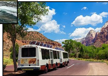
Zion Park Tram